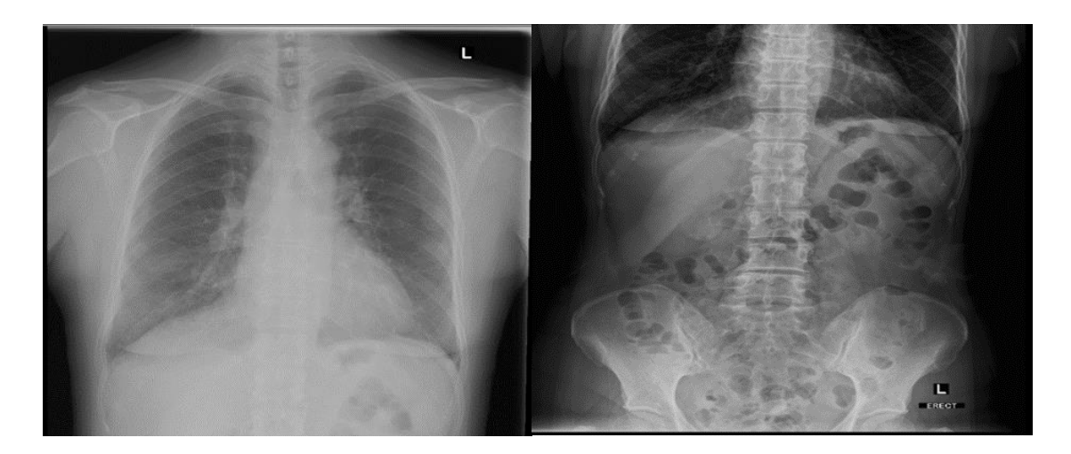
Figure 2. Chest and abdominal radiographs on admission (Case 2)