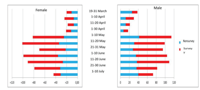
Figure 3. Hospital mortality of all patients by gender over 10-day periods COVID-19, the mean age and male sex ratios of the groups were 69.98 and 72.3 (p=0.001), 56.35%, and 53.38% (p=0.262), respectively. Fever, cough, and contact were significantly more frequent in the COVID-19 group (p=0.05, p=0.004, p=0.001, respectively). Other symptoms (edema, hemoptysis, hematemesis, vaginal bleeding, aspiration,

When patients were divided into COVID-19 and non-