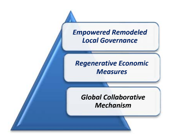
Fig. 2: Post COVID World Priority Areas

The immediate key priority post COVID-19 would be as identified by us could be classified into three areas. If strategic changes could be brought about in these three areas the post COVID world would be able to rise to higher economic progress with least disruption future pandemics.