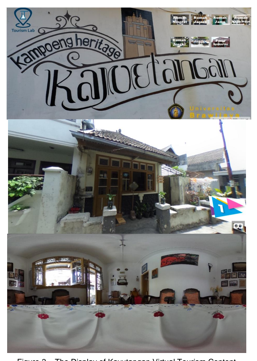
Figure 3 – The Display of Kayutangan Virtual Tourism Content

In the assembly stage, all virtual tourism objects or materials were made. Content creation required a set of PC with Windows OS, Gear Bobo VR Z5, Android Smartphone, and software (software) in the form of A-Frame, Glitch, Cardboard VR Application with a display as shown in Figure 3.