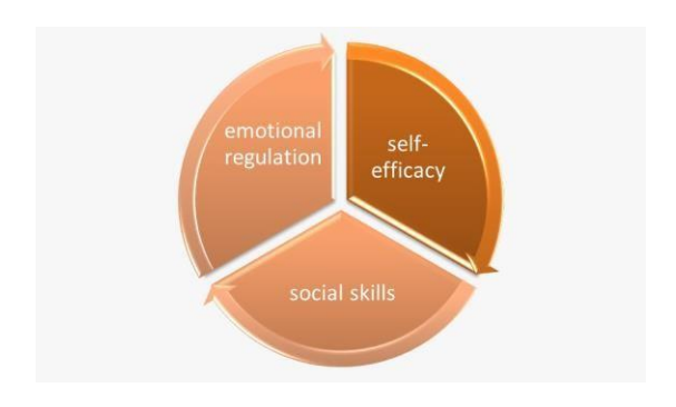
Fig 3. Indicates the skills necessary for a student

The above pie diagram explains the persona of a student with equally important (distributed) qualities. The emotional regulation is to control himself from home and outside environment and focus on the academics. Self-efficacy is to understand his own capabilities and social skills to be helpful and cooperative to each other.