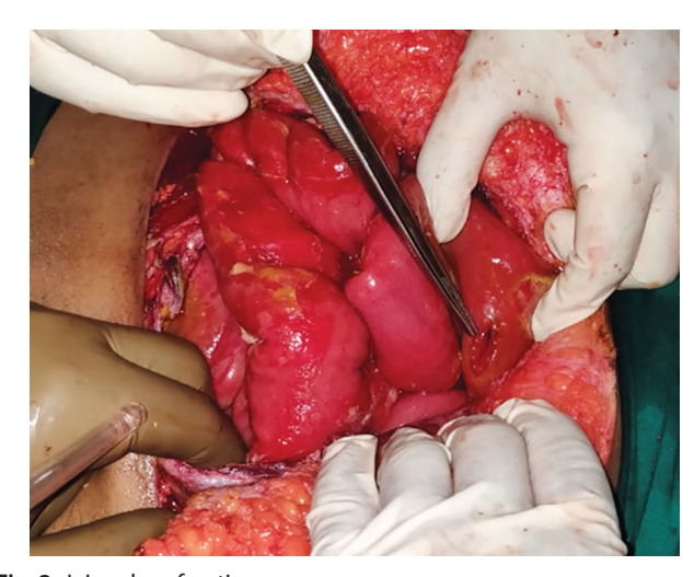
Fig. 3: Jejunal perforation