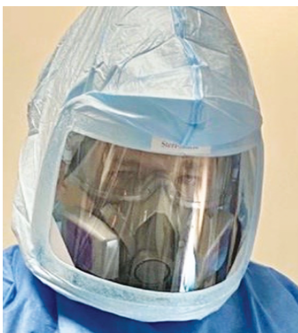
Fig. 2: Personal protection equipment with double protection during an aerosol generating procedure. Mask with N95 filters and goggles