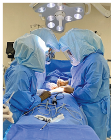
Fig. 1: Personal protective equipment similar to a diving suit with AAMI 4 protection

There are different types of material, the most common ones being latex, vinyl, and nitrile, from which the last one offers the highest protection; however, disposable gloves without a lining are recommended. 30 Everyone participating in perioperative care must wear them. It is recommended to wear double gloves when