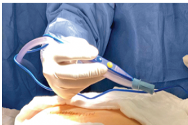
Fig. 4: Way to minimize smoke, using electrocoagulation connected to an aspirator

Considering the lessons learned in Asia and Europe, China and Italy, we can recover several of the published recommendations. 58 The authors recommend that hospitals should ideally be divided into two main categories: dedicated facilities for COVID-19-positive patients (with limited surgical personnel and operating rooms for those infected patients who require surgery) and others for emergency surgery and urgent oncological procedures in COVID-19-negative patients. As a result of these lessons, efforts should be made to increase the level of care given to operative