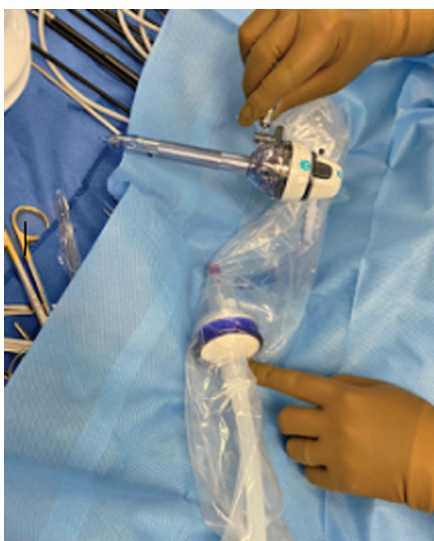
Fig. 5: Way to add filters to the insufflation hose and the trocar to avoid bidirectional contamination

the operating room, the protocols related to postoperative cleaning and disinfection protocols must be thoroughly observed as per hospital regulations. The devices used on patients with a suspected or confirmed infection must undergo a separate disinfection process, followed by proper labeling. It is likewise mandatory to specifically dispose of clinical waste in separate containers.